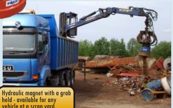
Hydraulic magnet with a grab hold - available for any vehicle at a scrap yard.