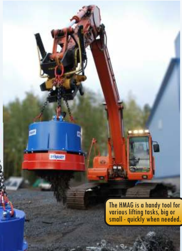
The HMAG is a handy tool for various lifting tasks, big or small - quickly when needed.

The excellent features of the hydraulic magnet make it a profitable tool. It greatly improves work efficiency and flexibility, and expands the possibilities of the work machine.